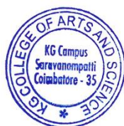
PRINCIPAL KG COLLEGE OF ARTS AND SCIENCE COIMBATORE - 641 035.