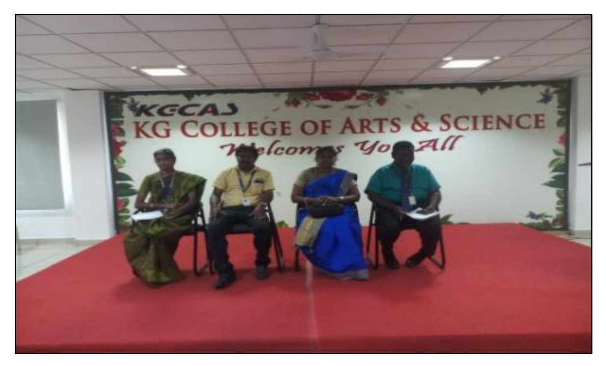
13/10/2018 – 3<sup>rd</sup> International Conference on Gender Conflicts as Evident in Contemporary English Literature